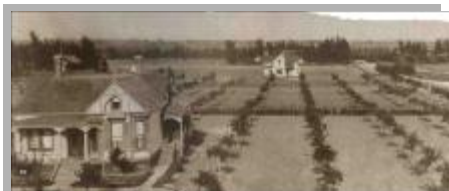
Houses such as this one on Garfield and Main were typical of those found on the Alhambra Tract in the 1870's.

The city's name, "Alhambra" was first derived from Washing Irving's "Tales of the Alhambra." Irving's description of Granada, Spain closely mirrored Alhambra's pre-developed land in the 1870's.