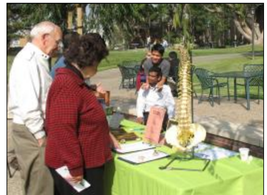
Last November's Expo attracted several hundred attendees and approximately 20 organizations.

At least 20 exhibitors are expected to share their expertise and provide services and materials